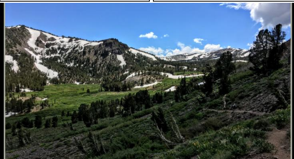
2017 Big Hike

This newsletter is intended for use by members of the Club and their families. Contributions are the sole responsibility of the authors and should not be construed to represent an official position of the Club or the IBM Corporation.