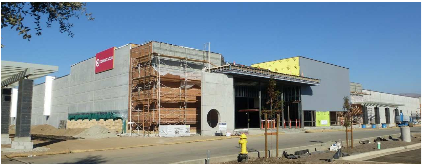
Cottle Road Construction - Target scheduled to open spring 2014